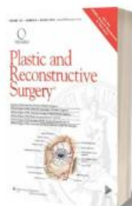
Plastic and Reconstructive Surgery