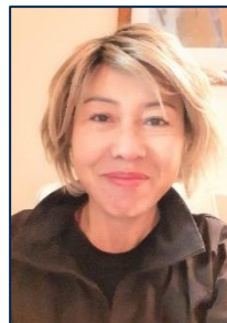
Health and Counselling