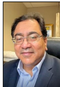
Skin Cancer Medicine