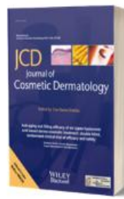
Journal of Cosmetic Dermatology