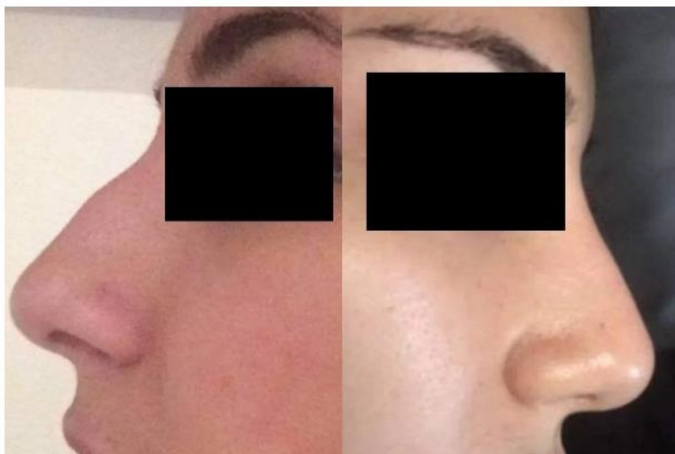
Before and after nose filler.

"I saw immediate results, which I loved," she said. "I already felt a lot more confident."